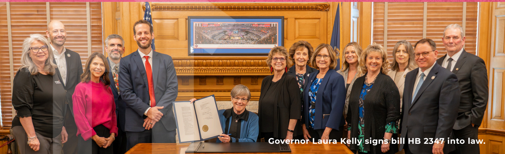
Governor Laura Kelly signs bill HB 2347 into law.

As we reflect on the first part of 2026, we are filled with gratitude and awe at all God has accomplished through this ministry, our residents, volunteers, and partners. His hand has been evident in every step, every opportunity, every act of service, and every transformed life.