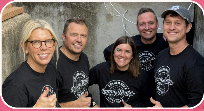
Thank you to the Golden Rule Design & Build Team!