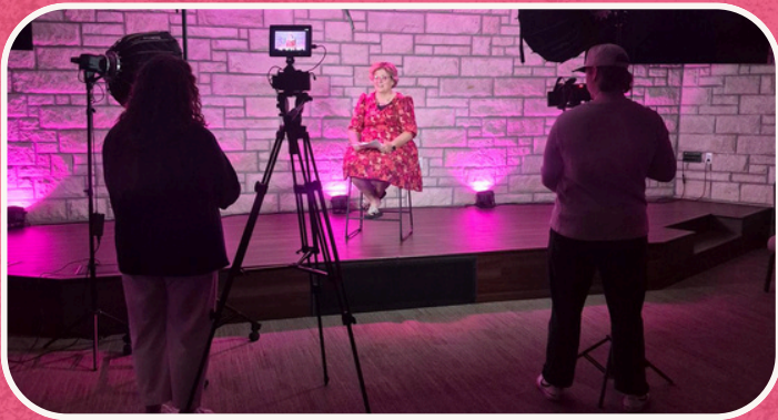
Thank you FBC Media Team!