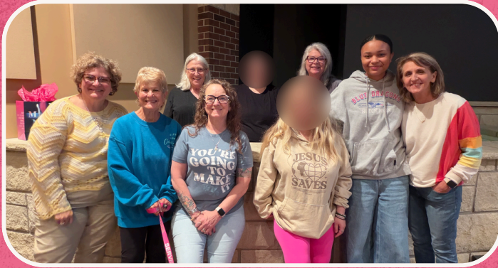
Baptism Celebration - April 2026