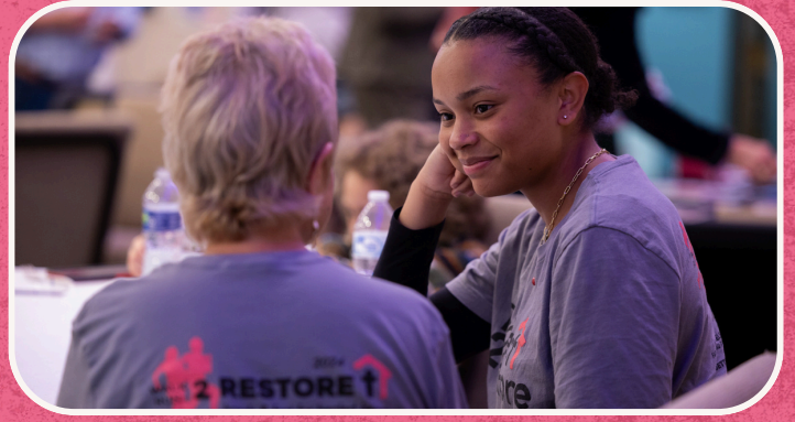
Hiding in Plain Sight event.