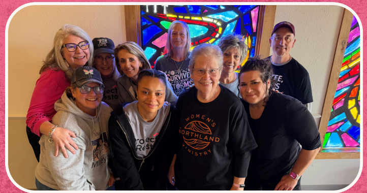
SRA Training in Manhattan.

As we move forward, we trust God's vision for this ministry, believing for continued growth, healing, and transformation in the lives we serve and throughout our community. Thank you for partnering with us in this mission. Together, we are seeing lives changed, hope restored, and hearts surrendered to Christ.