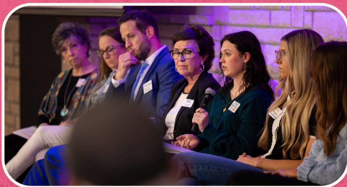
Panelist speaking at Hiding in Plain Sight event.

Beyond the home, we have seen God move in powerful ways. We celebrate being named a Patterson Legal Group Give Back recipient and a DeVaughn James Injury Lawyers Pay It Forward recipient, reminders of strong community support.