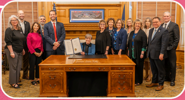
Governor Laura Kelly signs bill HB 2347 into law.