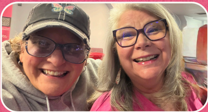
Leadership at SRA Training in Manhattan.